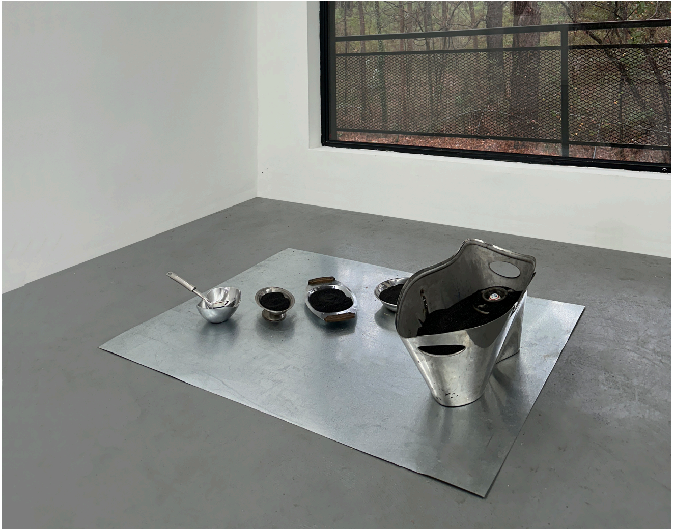
Rosa Duffy The Sea , 2026 Sheet metal, mixed media, sand, glitter. 36 x 48 x 10 in.