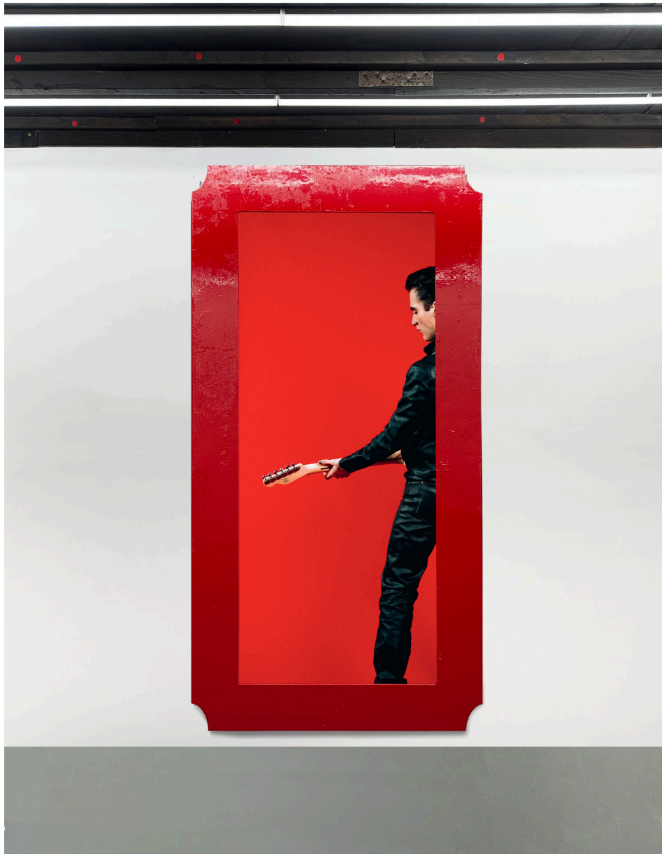
Isaac Mehki The King & the Rite of Spring: Pose 4 , 2025 Photo print in artist frame. 48 x 96 in. (each)