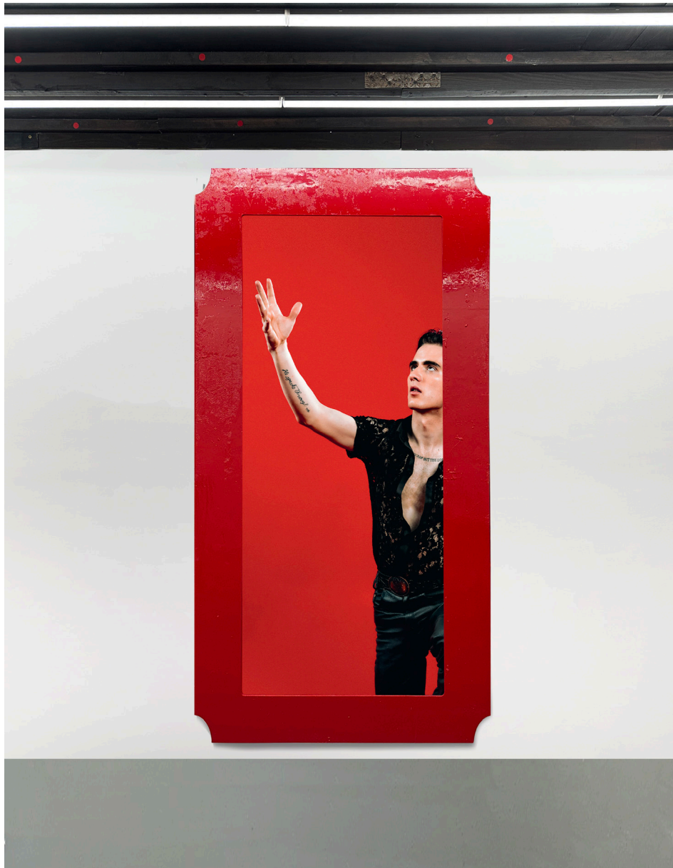
Isaac Mehki The King & the Rite of Spring: Pose 3, 2025 Photo print in artist frame. 48 x 96 in. (each)