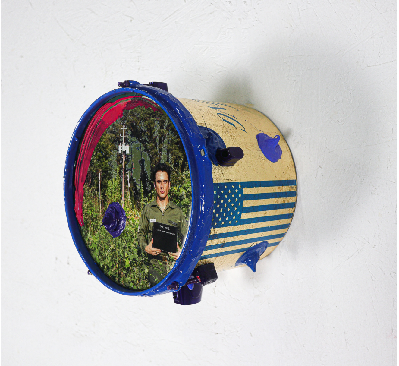
Isaac Mehki The King & The Good Elvis Drum , 2024 Inket on Mirror Mylar, Oil, Ink, Drum. 12 x 12 x 12 in.