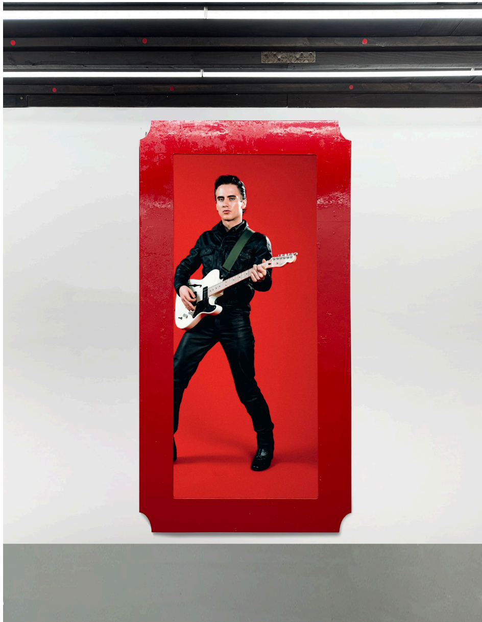
Isaac Mehki The King & the Rite of Spring: Pose 2 , 2025 Photo print in artist frame. 48 x 96 in. (each)