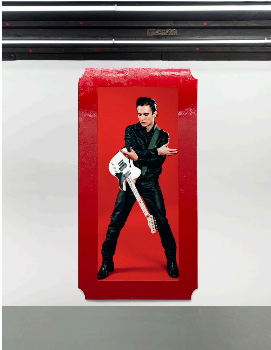
Isaac Mehki The King & the Rite of Spring: Pose I , 2025 Photo print in artist frame. 48 x 96 in. (each)